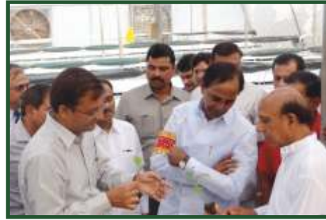
Honorable Chief Minister of Telangana Shree C S Rao @ VNR R&D Centre