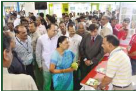
Honorable Chief Minister of GUJARAT Smt. Anandi Ben @ VNR Bihi Stall, Gandhinagar