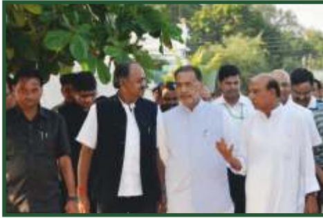
Honorable Central Agriculture Minister Shree Radha Mohan Singh @ VNR R&D Centre