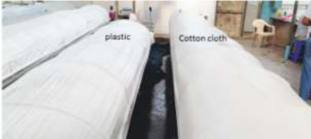
Healing of grafted plants....

A new experiment-covering of tunnel with plastic v/s cotton cloth, June-2015