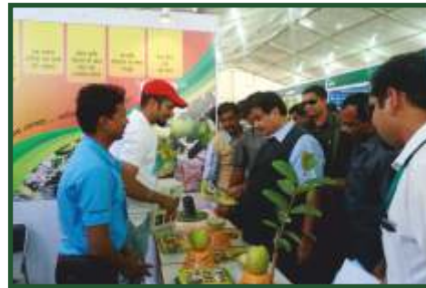
Honorable Central Minister of Transport Shree Nitin Gadkari @ VNR Bihi Stall, Nagpur