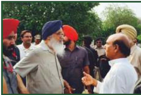
Honorable Chief Minister of Punjab Shree Prakash Singh Badal @ VNR R&D Centre