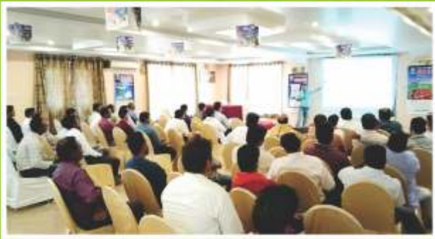
Retailer Meeting @ Bilaspur, CG