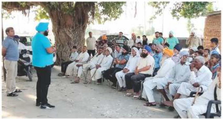
Presowing Meeting@ Bartoli(Haryana)