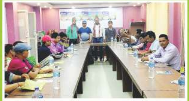
Retailer Meeting @ Nepal