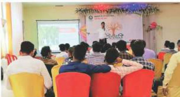
Retailer Meeting @ Kawardha, CG