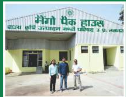
Visit of Team Nursery to Mango Pack House and meeting the Mango Man @ Mahiabad, UP