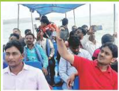
GOA Trip : Distributors & Retailers of Jharkhand