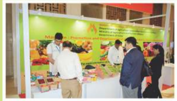
Fresh India Show @ Delhi 7-8 June 2018