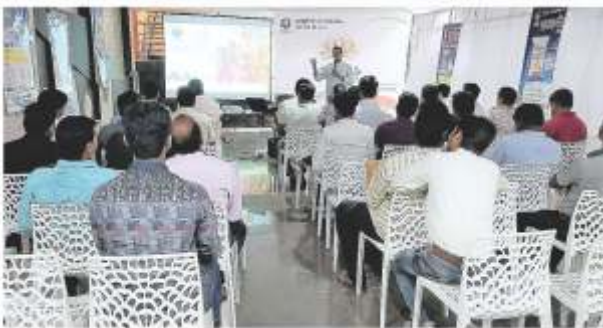
Retailer Meeting @ Saraipali (CG)