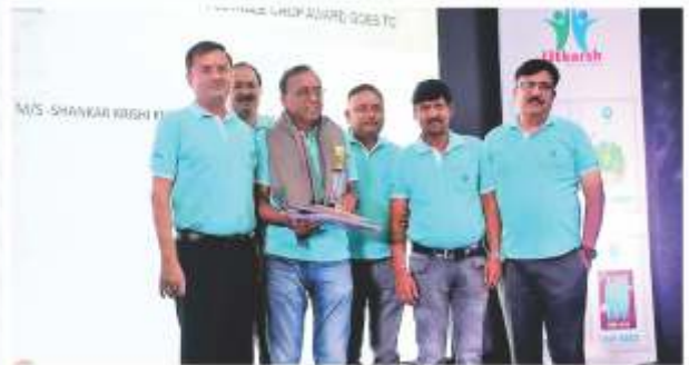
Distributor Meeting @ Ranchi