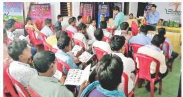
Retailer Meeting @ Pakhanjur, CG (South)