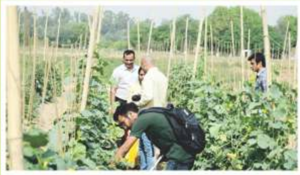
Grafted Vegetables Trials @ HAU Hisar, Haryana