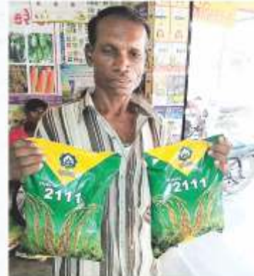
Hybrid Paddy Sales @ Gujarat