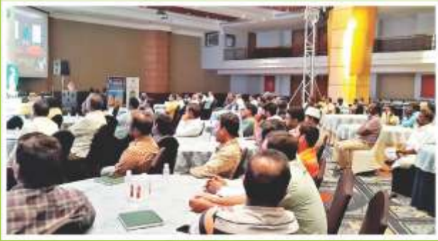
Retailer & Distributor Meet @ Hyderabad, Telangana