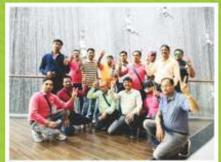
Dubai Trip: Distributors & Retailers of Jharkhand