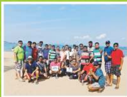
Bangkok Trip: Distributors & Retailers of Jharkhand