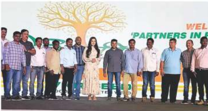
Retailer & Distributor Meet @Hyderabad (TS)