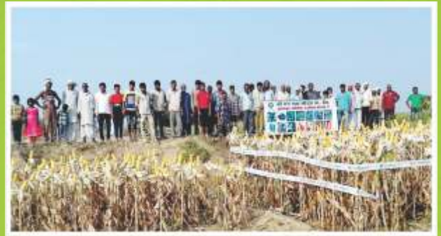
Farmer Meeting @ Chhara, Aligarh, UP