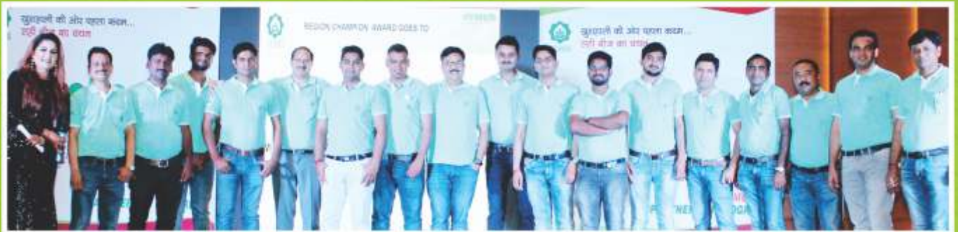
Distributor Meeting held at Raipur, CG