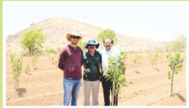
CUSTARD APPLE FIELD VISIT @ MAHASAMUND (C.G.)