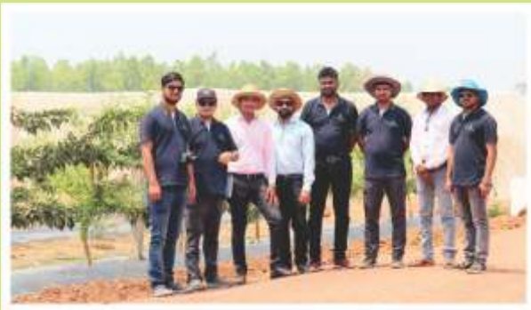
Field Visit @ Jaitgiri Jagdalpur, CG