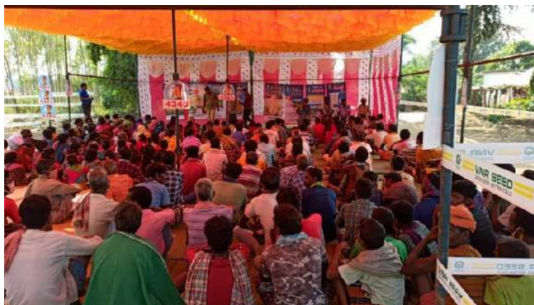
VNR 4343 Field Day at Nabarangpur, Odisha