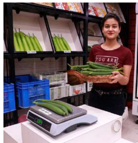
VNR product display at Vegetable store, Raipur (CG)