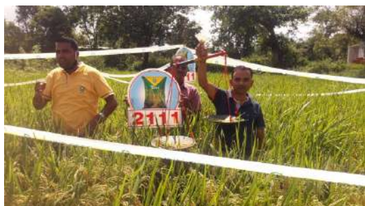
VNR 2111 Farmers' Training Program and Field Day at Ramgarh, Jharkhand