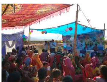
Farmers' Training Program and Field Day on newly launched Hybrid VNR 2228 and VNR 2318 at Bundu, Jharkhand