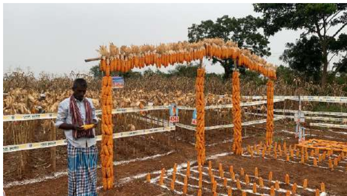
VNR 4343 Field Day at Davanagere, Karnataka