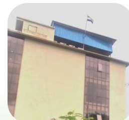
Biotech Lab/C&F, Raipur