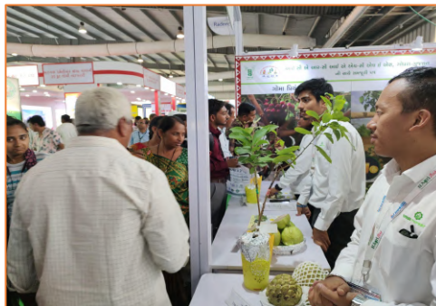
VNR Nursery Participated in an Agri Asia Exhibition at Gandhinagar, GJ