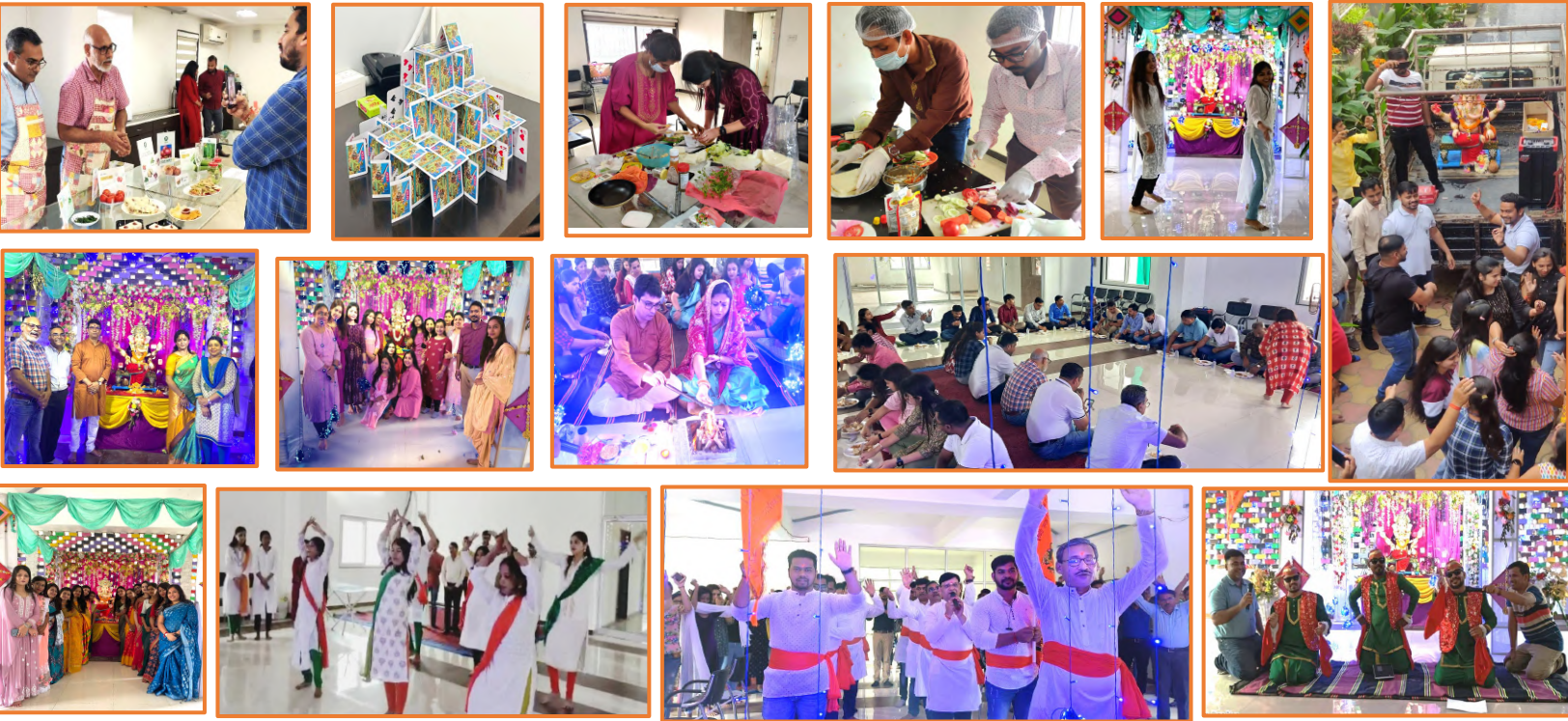
Special performance by Finance/Admin team