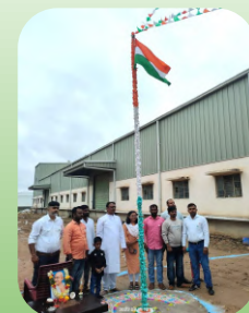
Bandamailaram Plant, TS