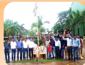
Deorjhal Plant, CG