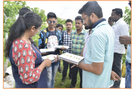
VNPL organized a Training Program at Jagdalpur, CG on Hand Pollination in Custard Apple