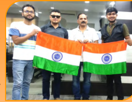
VNR Nursery Team

Azadi Ka Amrit Mahotsav is an initiative of the Government of India to celebrate and commemorate 75 years of independence and the glorious history of its people, culture and achievements. Apart from flag being hoisted at various company premises, VNRites participated in the Azadi Ka Amrit Mahotsav, Har Ghar Tiranga , campaign by hoisting the national flag at their home and posing before the tiranga with family and friends. It is indeed such a moment of pride for us to share these experiences with you all. We are proud to be an Indian!