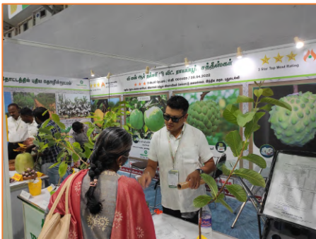
VNR Nursery Participated in an Agri Intex Exhibition at Coimbatore, TN