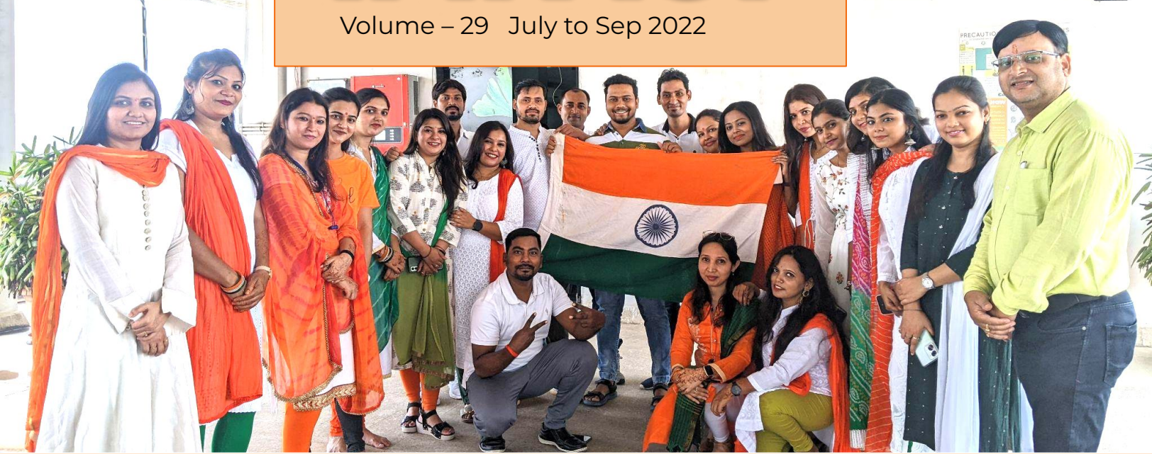
VNR Team Celebrating Azadi Ka Amrit Mahotsav