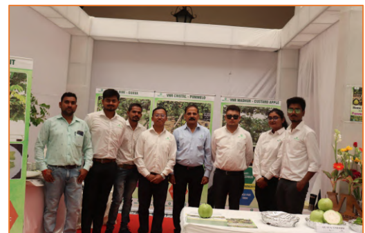
VNR Nursery Participated in an event at Club Paraiso, Maruti Lifestyle, Raipur, CG