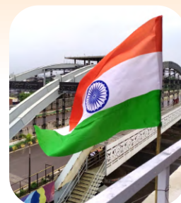
Corporate Centre, Raipur