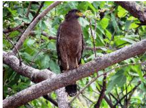
Crested Serpent Eagle

मैं काफी समय तक कन्जक्टीवाइटीस बीमारी से परेशान रहा और काफी तकलीफ से भी गुजरा, और ऐसा आप सभी के साथ भी ना हो इसलिए कुछ सामान्य नियमों का पालन जरूर करें जो कि मुझे डॉक्टर ने दी है।