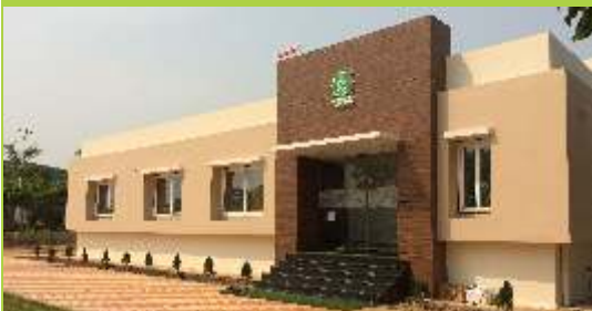
Administrative Office and Seed Testing Lab @ VNR Plant Deorjhal (Chhattisgarh)