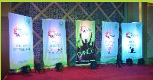
VNR Milan 2016 @ Raipur

Seed Testing Lab and Administrative block is inaugurated at VNR's Deorjhal Plant on Monday, 7th March 2016 on the auspicious occasion of Mahashivratri. This facility is a step towards seed quality assurance infrastructure upgradation programme of VNR. The new facility with built-up area of more than 6000 sq. ft. Spread across 2 floors with 60 plus seating capacity. It comprises 2 blocks, one admeasuring around 2500 sq. ft.—which is 4 times of earlier facility—dedicated for Seed Testing Laboratory and rest is an extension for administrative function of Deorjhal plant.