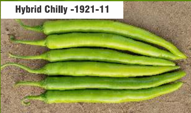
Hybrid Chilly -1921-11