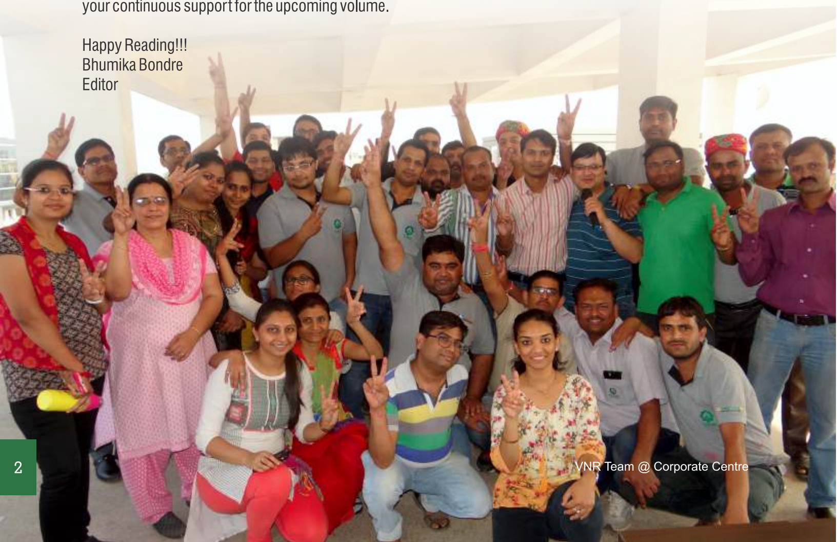
VNR Team @ Corporate Centre