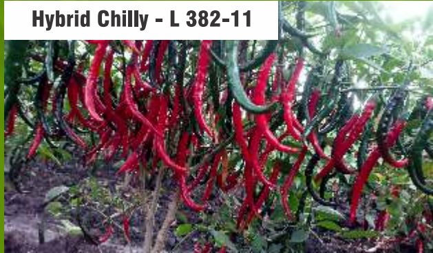
Hybrid Chilly - L 382-11

Adaptable States – Andhra Pradesh, Karnataka and Punjab