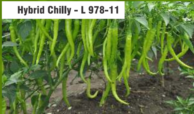
Hybrid Chilly - L 978-11

Adaptable States – Telangana, Andhra Pradesh, Karnataka, Maharashtra, Gujarat, Madhya Pradesh, Rajasthan, Uttar Pradesh