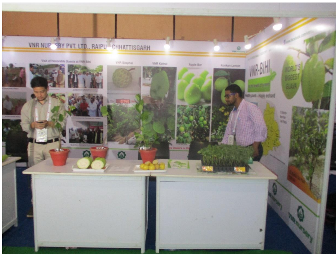
Plate 1. - An introduction of new varieties in exhibitions.