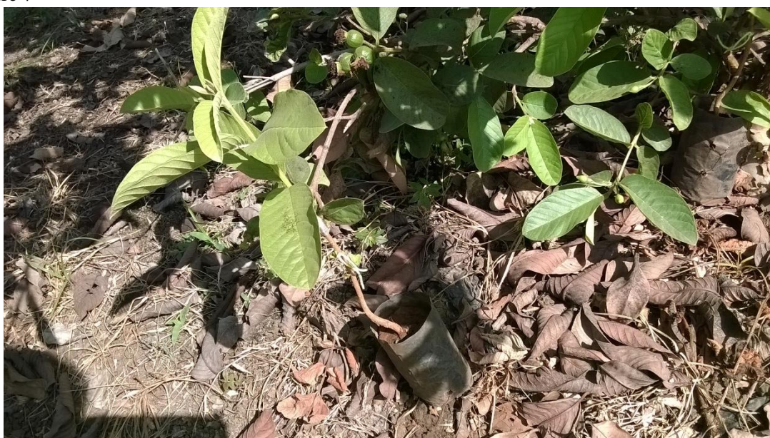
Plate 3 – Multiplication of VNR bihi @ Bharuch GJ.